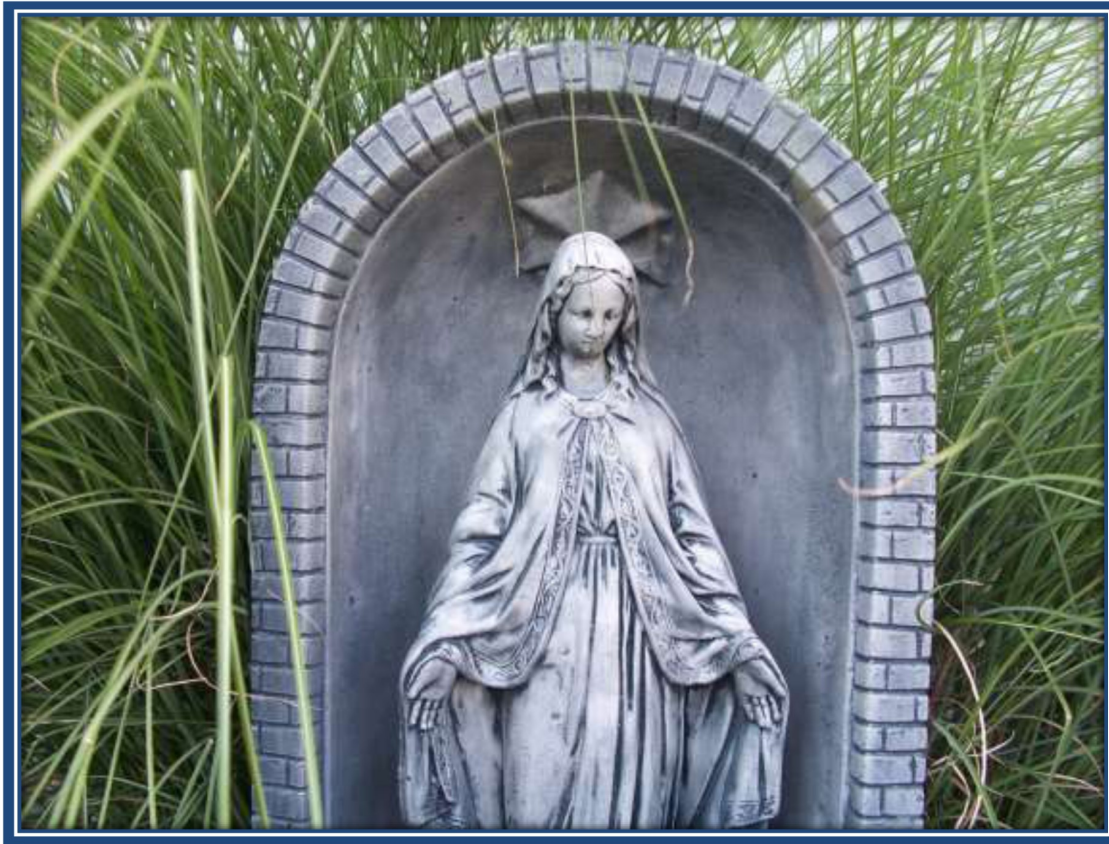
Our Lady Star of the Sea